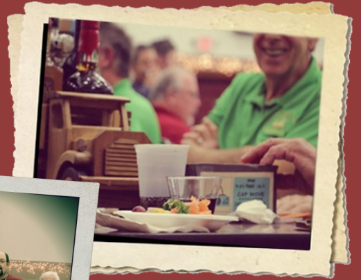
Local 1596 Christmas Party