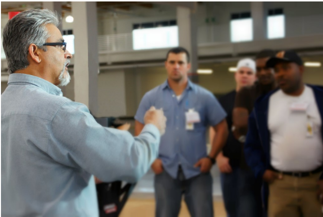
UBC International Training Center—Las Vegas, Nevada

Members of the New England Regional Council receive the bulk of their training at the Council's main apprenticeship training center in Millbury, Massachusetts but with members scattered throughout six states, satellite centers offer a convenient way to stay up-to-date with mandatory and upgrade training. The Manchester satellite center opened in June 2013 with more than 5,000 square feet of highly functional space, with two classrooms, carpentry and drywall shops and areas for concrete and scaffold training. The Manchester center also helps members fulfill their "Carpenters Basic Training Program," which is required by the collective bargaining agreement and includes first aid/CPR, scaffold user, fall protection and 30-hour OSHA training.