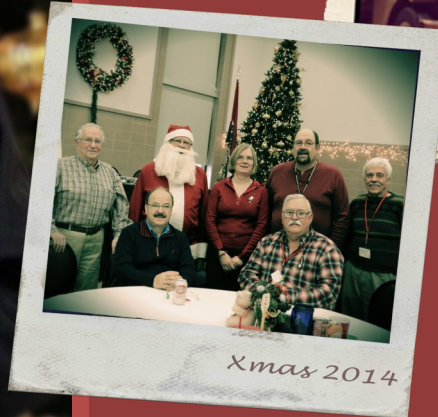
Retirees' Club #21