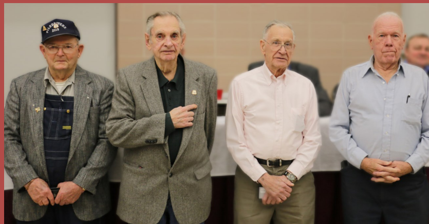
Local 97 65-year members