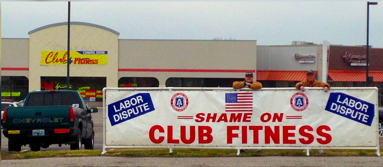
Carpenters' members boycott the Club Fitness location at 10047 Gravois Road in Affton